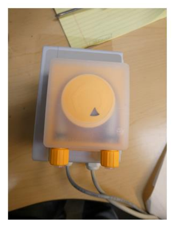
Models/Serial Numbers Affected